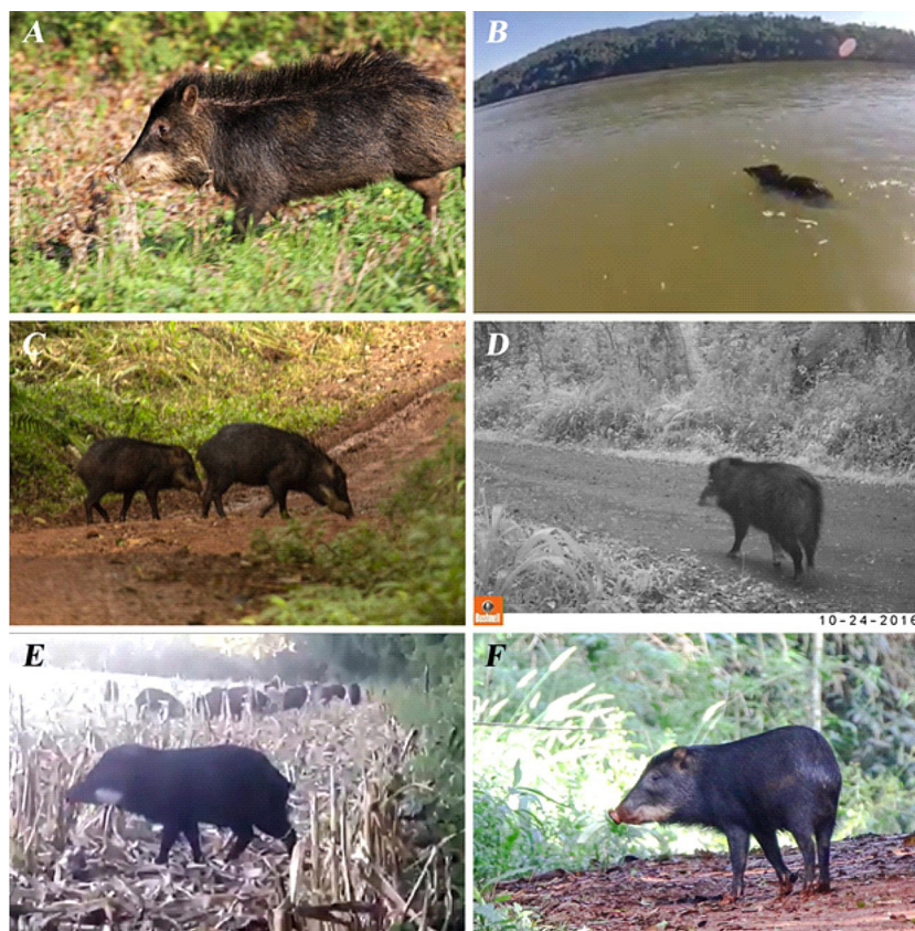
Figure 2 – Records of the White-lipped Peccary ( Tayassu pecari) in Turvo State Park (PET), Rio Grande do Sul, Brazil. The species was recorded twice in the surroundings of the PET, where it was feeding under Hovenia dulcis trees and at corn remains (A and E), it was also recorded once crossing the Uruguay River, from Misiones (Argentina) to PET (B), and it was recorded three times inside the PET, in the road that leads to Yucumã Falls (C, D and F).

We also describe here two new records for the border of the states of Rio Grande do Sul and