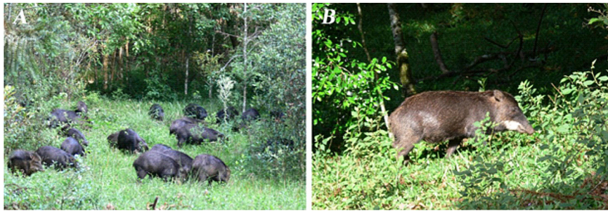
Figure 3 – Records of the White-lipped Peccary ( Tayassu pecari ) in Bom Jesus, Rio Grande do Sul state (A) and in Campo Belo do Sul, Santa Catarina state (B).